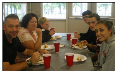
HBC All Church Picnic 2013