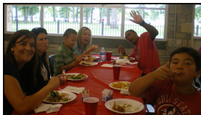
HBC All Church Picnic 2013