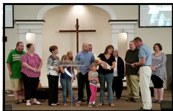
Perry is dedicated on July 12, 2015