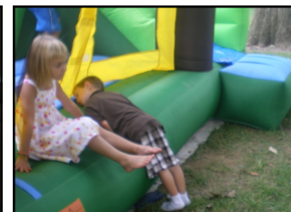
HBC All Church Picnic 2011