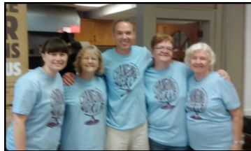
Neighborhood Pride Week at Hillcrest Baptist Church 2015

A ministry that focuses on creating authentic relationships in the context of passionate devotion to Jesus and intentional discipleship... plus fun.